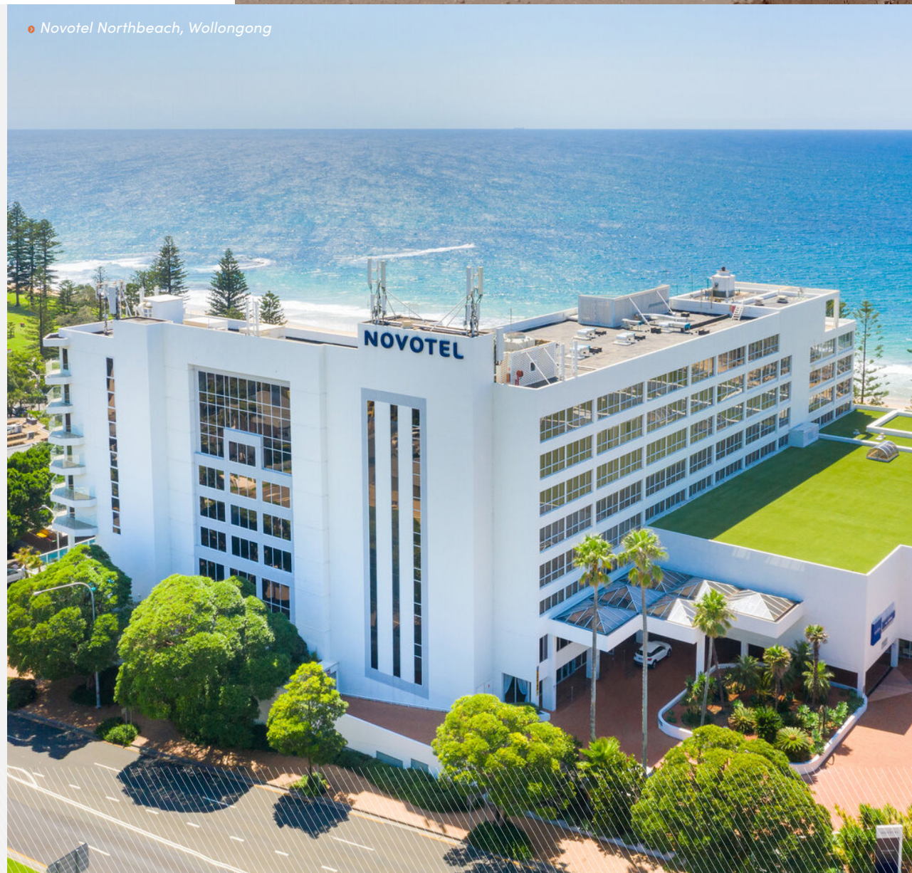
Novotel Northbeach, Wollongong

*DISCLAIMER: Presenters and presenting schedule is subject to change as a result of speaker availability