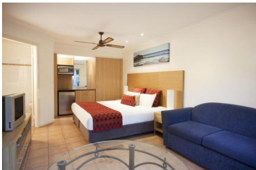
Hotel Studio Room

There is also a wide range of accommodation options in Coffs Harbour, which is only some 10 minutes' drive from Aanuka Beach Resort.